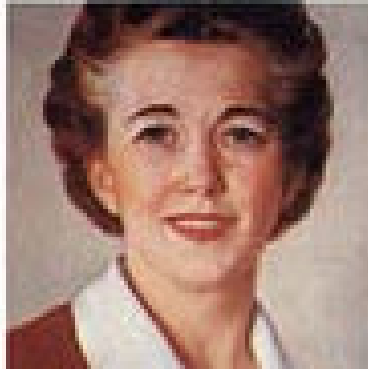
The 1955 incarnation of Betty Crocker

I can almost taste the Sunday pot roast and creamy mashed potatoes now...mmmm. All the foods that Mom used to make are showing up on menus across the country.